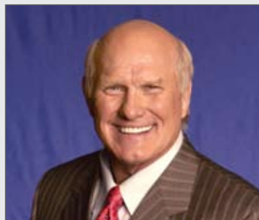
KEYNOTE SPEAKER Terry Bradshaw Superbowl Champion and TV Broadcaster