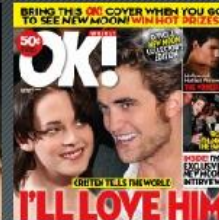
OK! 'New Moon' Magazine Special Issue Hits Stands Today!