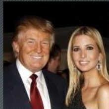
Donald Trump Gives Marriage Advice to Ivanka, Matches Omarosa to ...